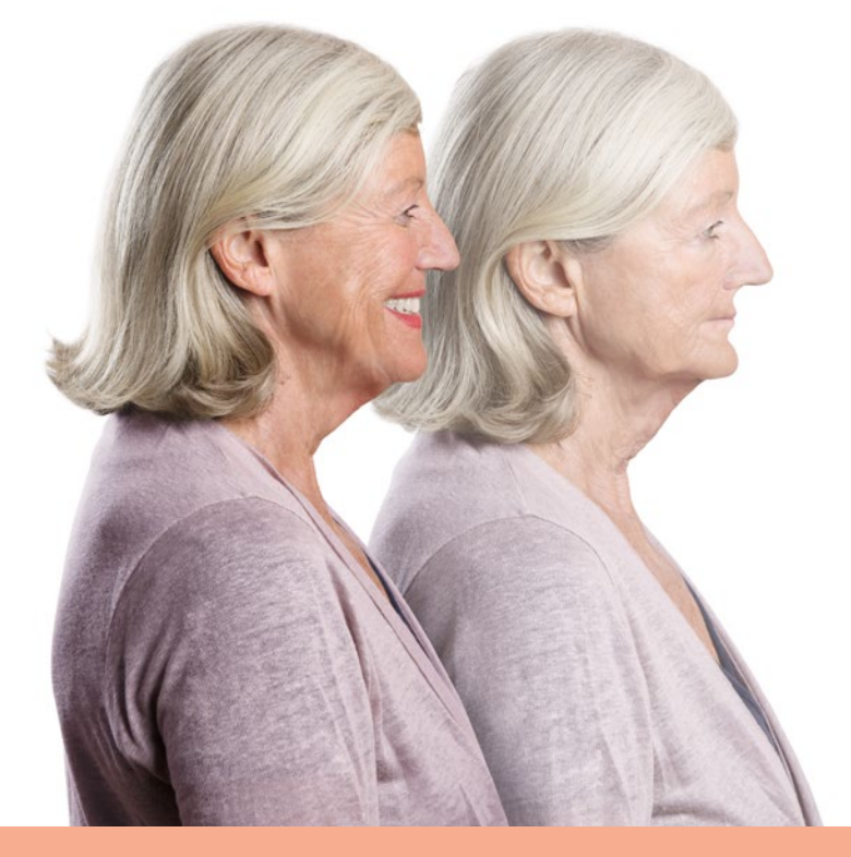
This picture clearly shows the consequences of tooth and bone loss.