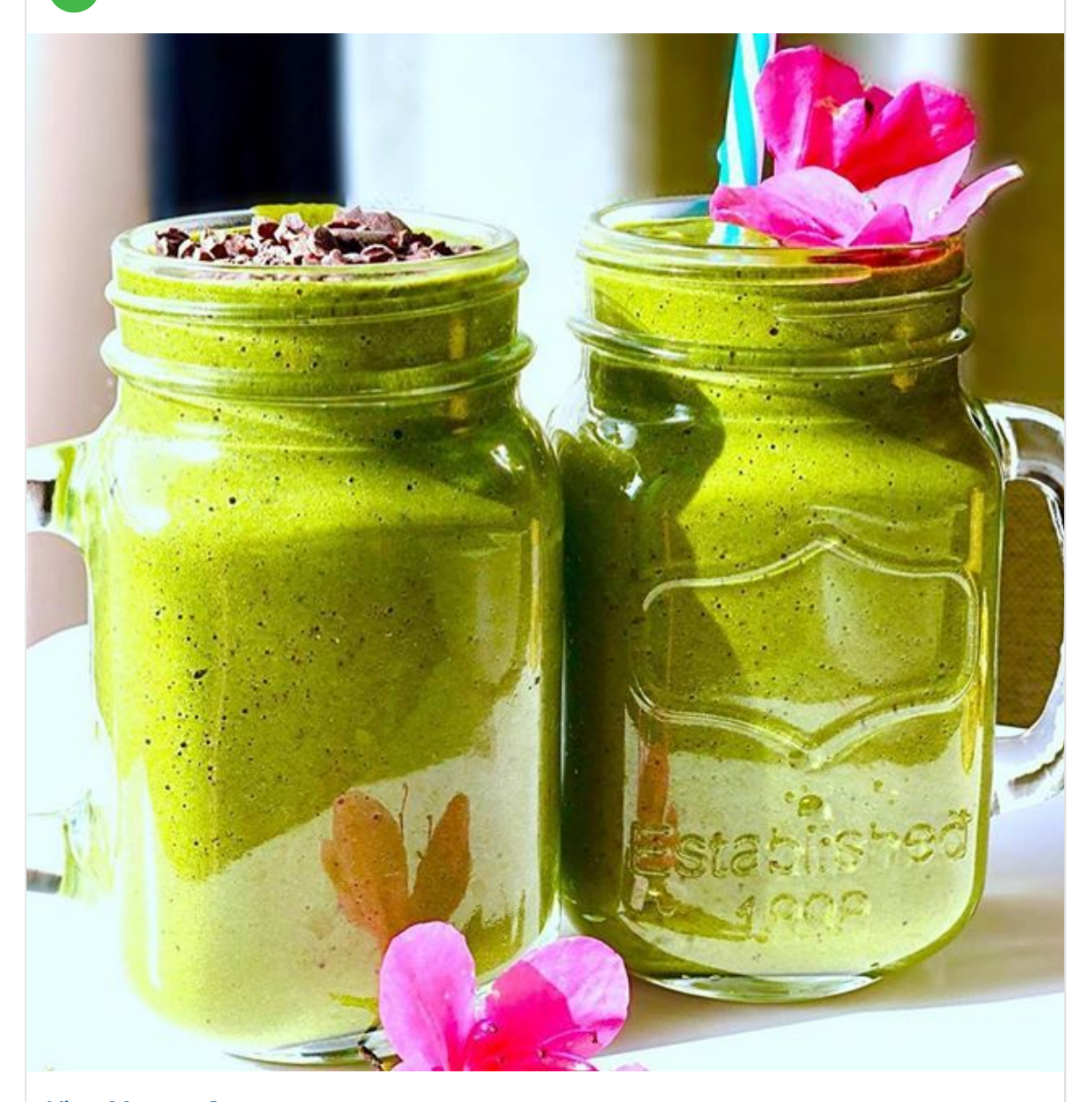
View More on Instagram